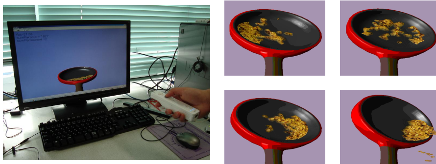
Fig. 4. System Appearance

The experiment was constructed on a system with a WiiRemote using a Intel Core 2 Duo E6300 1.86GHz CPU, 1024MB RAM. In this system, the GIB is supposed as fried rice (not traditional Chinese fried rice but Japanese) and the container as a skillet (Fig.4). Through this system, subjects were able to move fried rice by moving the container. 8 subjects evaluated the GIB movement's realism by classifying the score into seven grades. 1st grade is "This model doesn't feel real enough for a cooking system". 7th grade is "It is as natural as a real one". 3 subjects evaluated it as 4. 4 subjects evaluated it as 5. One subject evaluated it as 6. The results of the performance test is shown in the Table 1. We got some positive evaluations such as that GIB movement seems natural with 331 vertices and 670 particles. Good results were obtained but there are some points that need improvement. We have to improve upward movement of the GIB without the particle system. We are also developing a model for using cooking tools e.g. a spatula in this model.