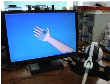
Figure 4: Experiment system with PHANTOM Omni.

It was evaluated whether subjects could compare virtual object size with real one. The number of right-handed subjects was nine and they did not have any experience of this system before experiments. The number of real object was eleven and the size was 100mm height and 10mm thicknesses, and the width was 20–70mm at 5mm intervals. The number of virtual object was also eleven just like real one. Every subject tried two times tasks for two given real objects. The task was to check a given real object first, then to try to select a same size virtual object from eleven virtual one (R→V). And they tried second tasks in the same way as first task (V→R). The result is shown in Table 1 . There were many correct answers and no error more than 10mm. We found that subject could see the size of virtual object from vibration feedback.