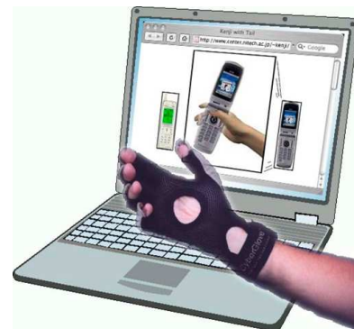
Figure 1: Illustration of our future system.

In our system, we considered the virtual hand in PC monitor which moves, opens and closes following the movement of the real hand which wears a data-glove and force feedback device. The illustration of our future system is shown in Figure 1 . Although the data-glove with vibrators and force feedback device we used were expensive exactly, the Essentialreality P5 GLOVE which was able to connect to PC via USB was marketed for around $100 recently, and The Novint Falcon which is force feedback device is marketed for around $200 ( Figure 2 ). It is expected that vibration and force feedback system are able to be attached on a data-glove such as the P5 GLOVE, and the glove with vibrators and force feedback element is able to be marketed in low-price if there are many demands.