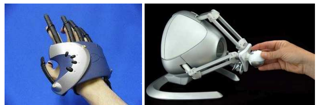
Figure 2: P5 GLOVE and Falcon.

For simplification, only rectangular parallelepiped is considered as commodity in the experimental system, for example, digital camera and mobile phone. When a subject touches a virtual object, the system convey information through vibration. However actual feeling of grasp dose not convey to a subject, subject feels touch sense